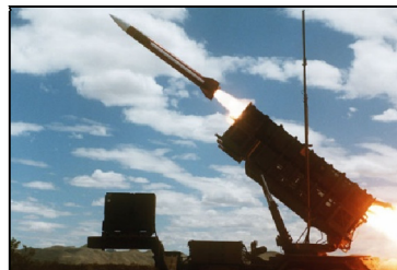
Patriot Missile System with Roll-Rings