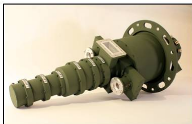
Diamond Antenna & Microwave Air Traffic Control Rotary Joint with Integrated Roll-Rings

Roll-Rings® deliver mission critical performance through maintenance-free long life operation and lower cost of ownership as compared to slip rings. A growing number of significant military and aerospace equipment customers rely on Roll-Rings® for their mission critical applications. NASA, the US Navy, Raytheon and others have subjected Roll-Rings® to full qualification testing and in each case Roll-Rings® have passed. Roll-Rings are a proven solution for rotary power, signal and data transfer.